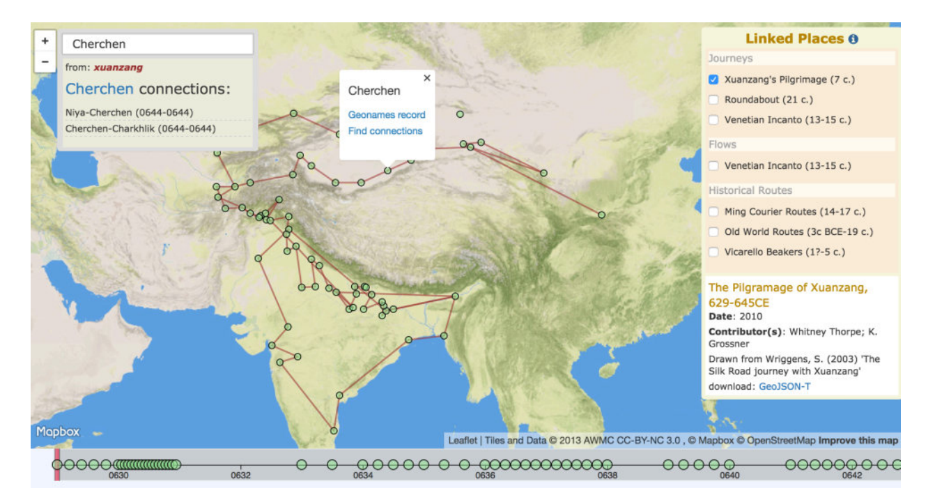
Figure 3 - Linked Places interface (partial view as of March 2017)

The widespread adoption of GeoJSON has demonstrated that for a data format to be useful, there must be software with visualization and analysis capabilities that supports it. Accordingly, an essential element of the Linked Places project is development of proof-of-concept web software to render GeoJSON-T data, for both routes and places alone, to a map and timeline together. The development of that software is ongoing, and publicly available<sup>12</sup>. ( Figure 3 ).